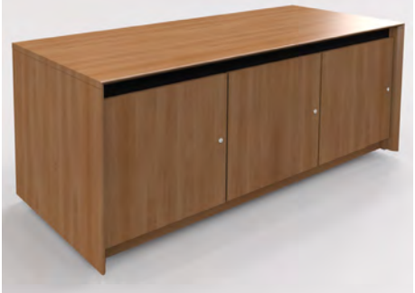
TYPE 5 MODERN

C5 Millwork Finishing Kits are available for 1, 2, or 3 bay Middle Atlantic Products 27" and 31" deep C5 Rack Frames. Wilcox Woodworks offers eight different styles to choose from. All styles are available in real wood veneers. Some styles are also available in HPL standard finishes. All styles are available with acrylic door inserts. Magnetic touch latches and all assembly hardware are included with the kit. Locks, pulls, or handles are available as an option.