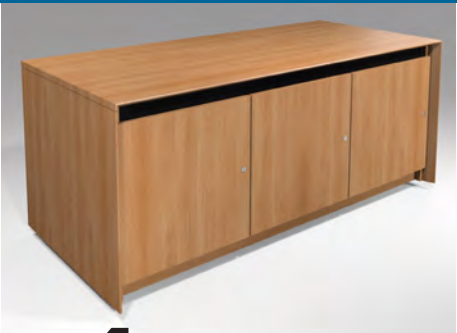
TYPE 4 MODERN

1" thick top and sides 3/4" thick doors Top waterfalls side panels Hardwood Radius Knife Edge Top & Sides Reversible Doors