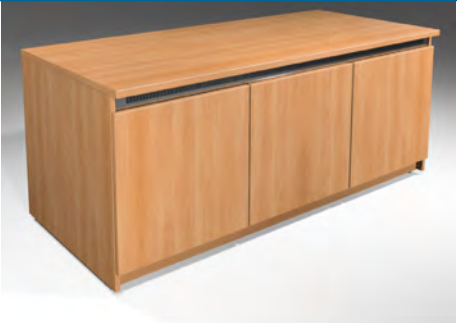
TYPE 2 CONTEMPORARY

1" thick top 3/4" thick sides and doors Reversible Doors Top is flush with side panels