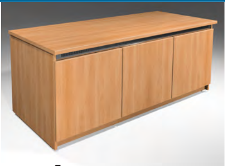
TYPE 1 CONTEMPORARY

C5 Millwork Finishing Kits are available for 1, 2, or 3 bay Middle Atlantic Products 27" and 31" deep C5 Rack Frames. Wilcox Woodworks offers eight different styles to choose from. All styles are available in real wood veneers. Some styles are also available in HPL standard finishes. All styles are available with acrylic door inserts. Magnetic touch latches and all assembly hardware are included with the kit. Locks, pulls, or handles are available as an option.