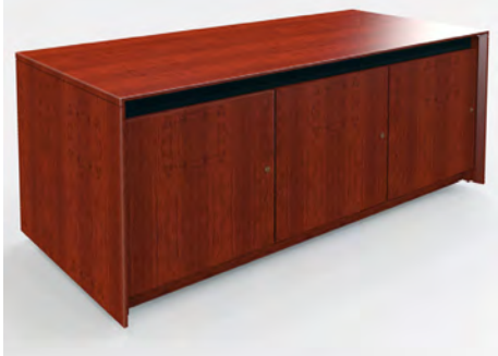
TYPE 3 MODERN

1" thick top and sides 3/4" thick reversible doors Top waterfalls side panels Hardwood Knife Edge at Top & Sides Reversible Doors