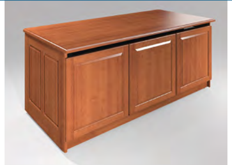
TYPE 7 TRADITIONAL

1" thick top 3/4" thick solid wood raised panel doors and sides. Not available in HPL Veneered top with hardwood edge