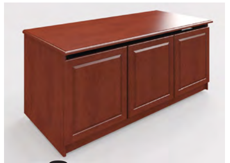
TYPE 8 TRADITIONAL

1" thick veneered top with hardwood edges 3/4" thick solid wood raised panel doors 3/4" thick Veneered side panels with hardwood edges Not available in HPL