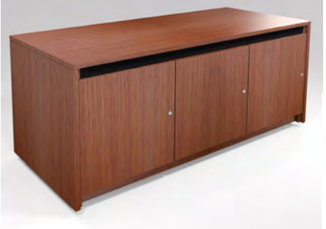
TYPE 6 MODERN

1" thick top and sides 3/4" thick doors Top waterfalls side panels Veneer Self Edge Top & Sides Reversible Doors